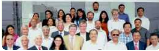
IICA-GIZ Business Responsibility Initiative – Phase II Implementation Agreement Signing Ceremony and Expert Group Meeting 3 rd July 2013, IICA, Manesar