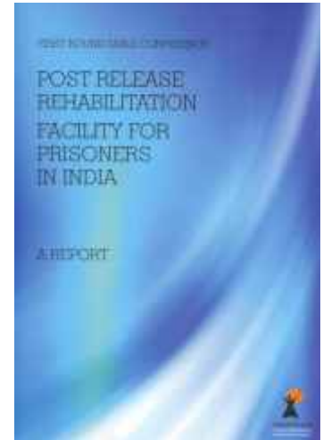
A report was also released during the conference developed by Antarkranti. The report titled "Post Release, Rehabilitation Facility for Prisoners in India"