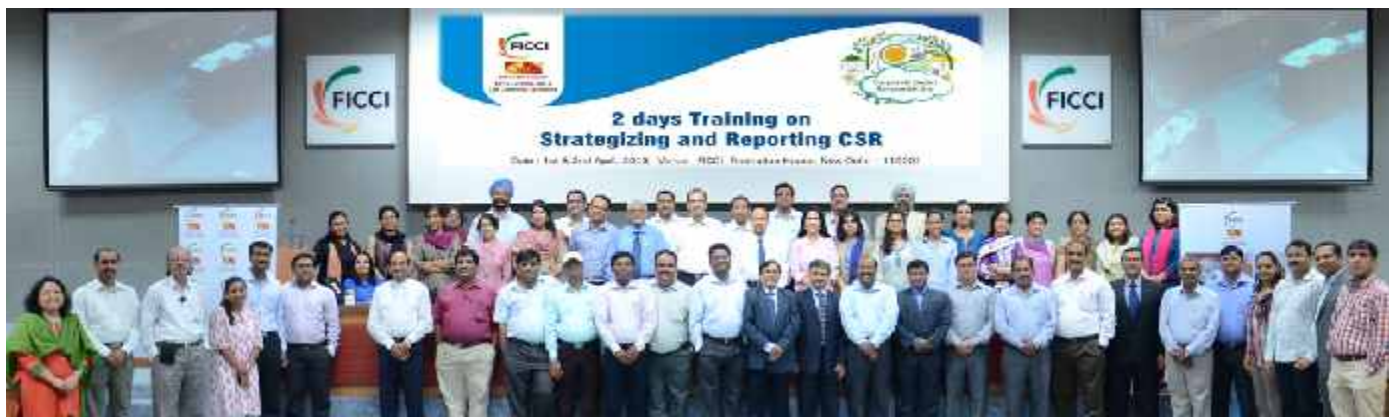
Participants of the "Strategizing and Reporting CSR" training held on 1st and 2nd April